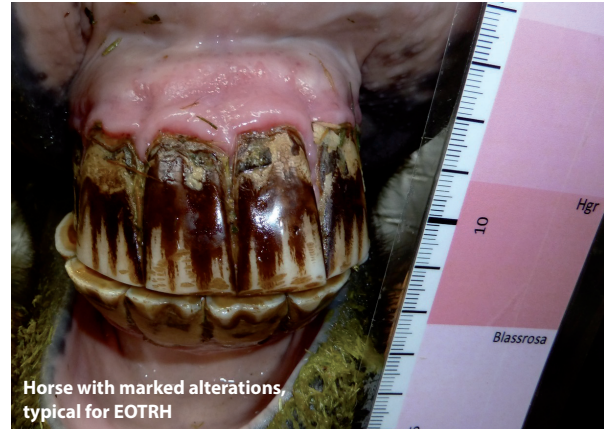
Horse with marked alterations, typical for EOTRH