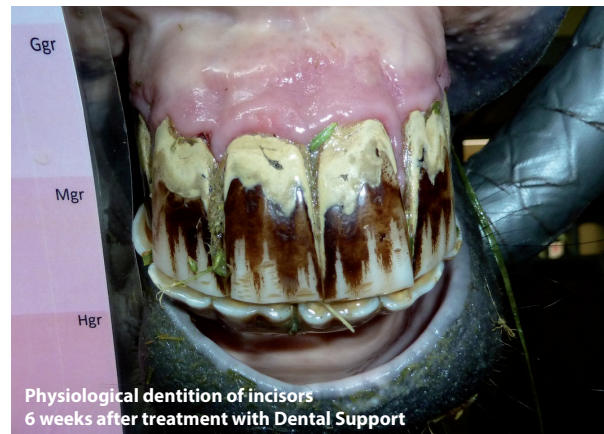
Physiological dentition of incisors 6 weeks after treatment with Dental Support